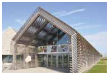
The Tourist Information Centre in the car park